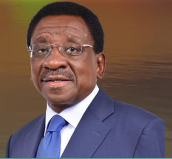
H.E. SC. James Orengo Governor, Siaya County