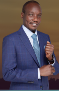
H.E. Simba Arati Governor, Kisii County