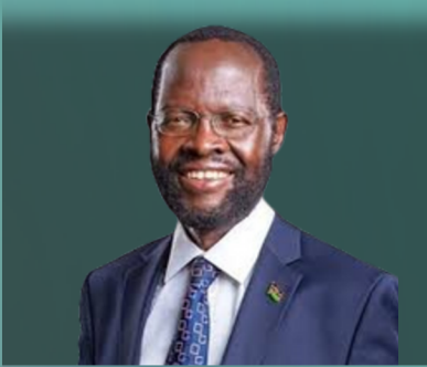
H.E. Prof. Peter Anyang' Nyong'o Chair-Lake Region Economic Bloc & Governor, Kisumu County