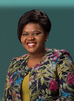
H.E. Gladys Wanga Governor, Homabay County