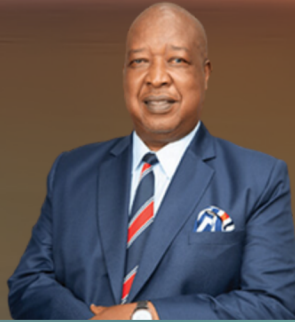
H.E. Amos Nyaribo Governor, Nyamira County