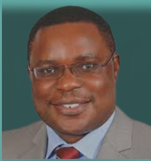
H.E. Kenneth Lusaka Deputy Chair-Lake Region Economic Bloc & Governor Bungoma County